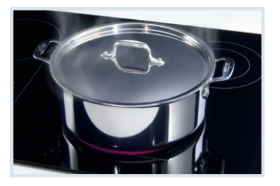
PowerPlus<sup>™</sup> Boil Boil water fast with our 3,100-watt element.